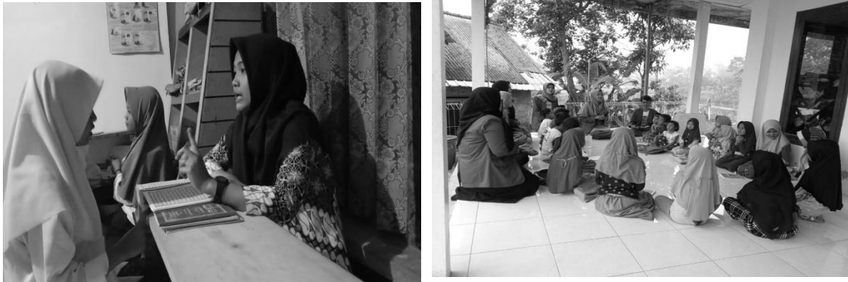
Figure 3. Implementation of activities

In every implementation of habituation activities, there are supporting and inhibiting factors. As for the supporting factors in the implementation of the habituation method in order to foster religious values in children, one of the main influences is the support from parents. The school and parents carry out the formation of the religious character of children. Because after arriving home, students will be coached directly by their respective parents in behaving. Among the most important factors in the family environment in forming a child's religious character is the parents' understanding of the child's basic psychological needs, including a sense of affection, security, self-esteem, freedom, and a sense of success. In addition to attention, parents also set a good example for their children, peace and happiness are the most important positive factors in forming a child's religious character.