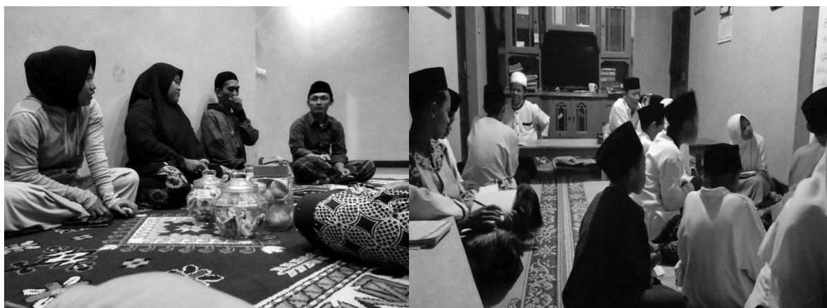
Gambar 1. Discovery

awaken children who have been wrong in the association. This is corroborated by observations that result in a lack of parental attention to children.