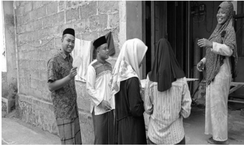
Figure 1. The survey proces