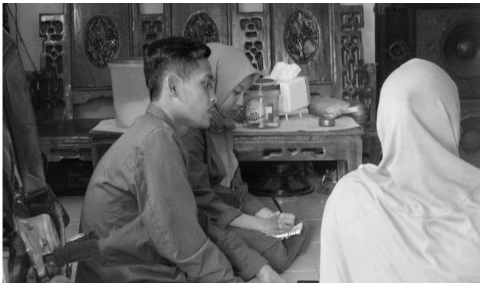
Produk Figure 2. Socialization Regarding Product Marketing