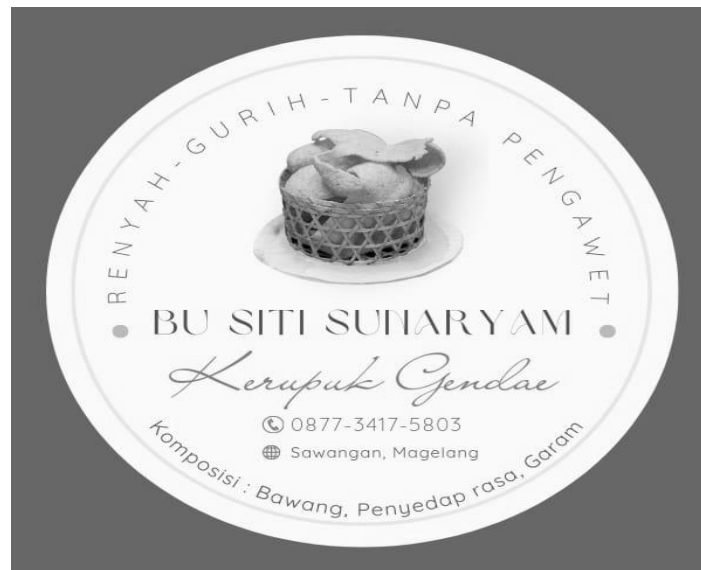
Figure 4. Branding

Currently, with conditions where anyone can easily access the internet, this is an opportunity for business actors to use internet facilities to increase their sales. Social media has become a platform for business activities, providing marketing strategy information to businesses to sell their products through Instagram and Whatsapp. With social media, the scope of marketing will be much more comprehensive, and profits can increase. The servant has created an Instagram account that anyone can easily access; previously, the servant also gave directions to business people regarding its use. The results of the training are as follows: