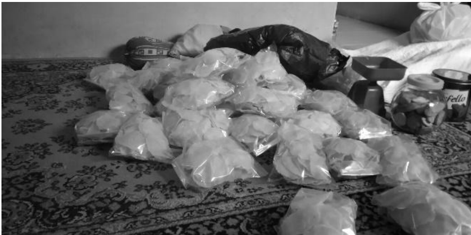
Figure 3. Packaging of Gendar Crackers Before Branding